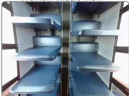
TruView Middle View