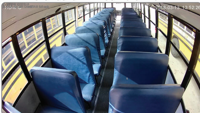
Standard 247 Camera View

Clear, sharp images. Standard on all 247 Cameras. Equivalent to de-curved OmniView360° images.