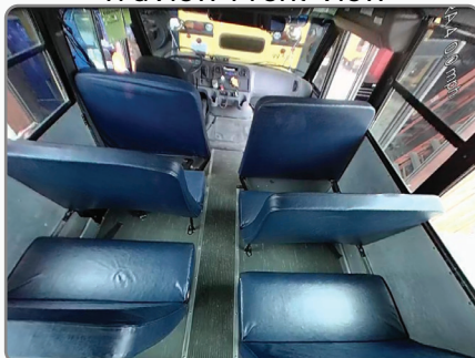
TruView Front View